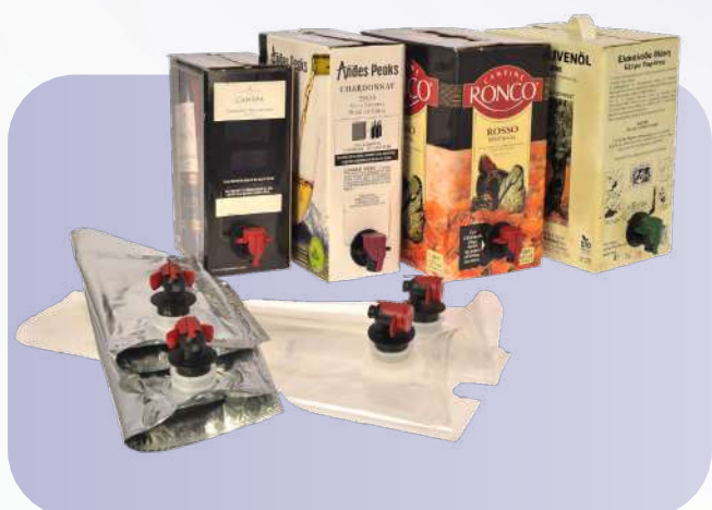
Aran's Products – BIB and fitments