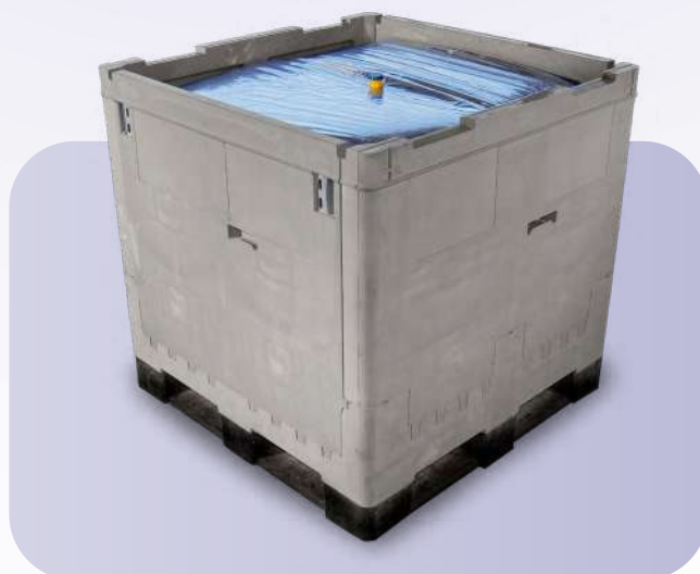
Innovative Folding Method for IBC's Pillow Liners